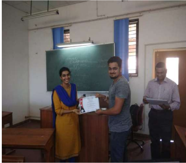
Photo 4: Distribution of Certificates to the Participants of Internship program