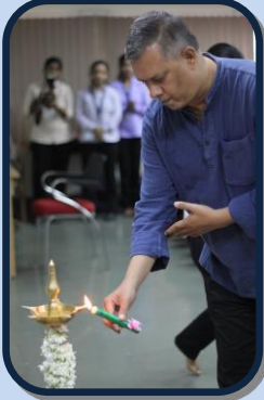
The Official Inauguration of the IET - Student chapter by ceremonial lighting of lamp & unveiling of IET Certificate